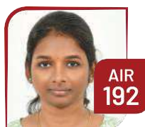
APSARA N SIA Mains - Naan Mudhalvan